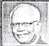
Dr. P.A. Mashelkar National Research Professor & President Global Research Alliance